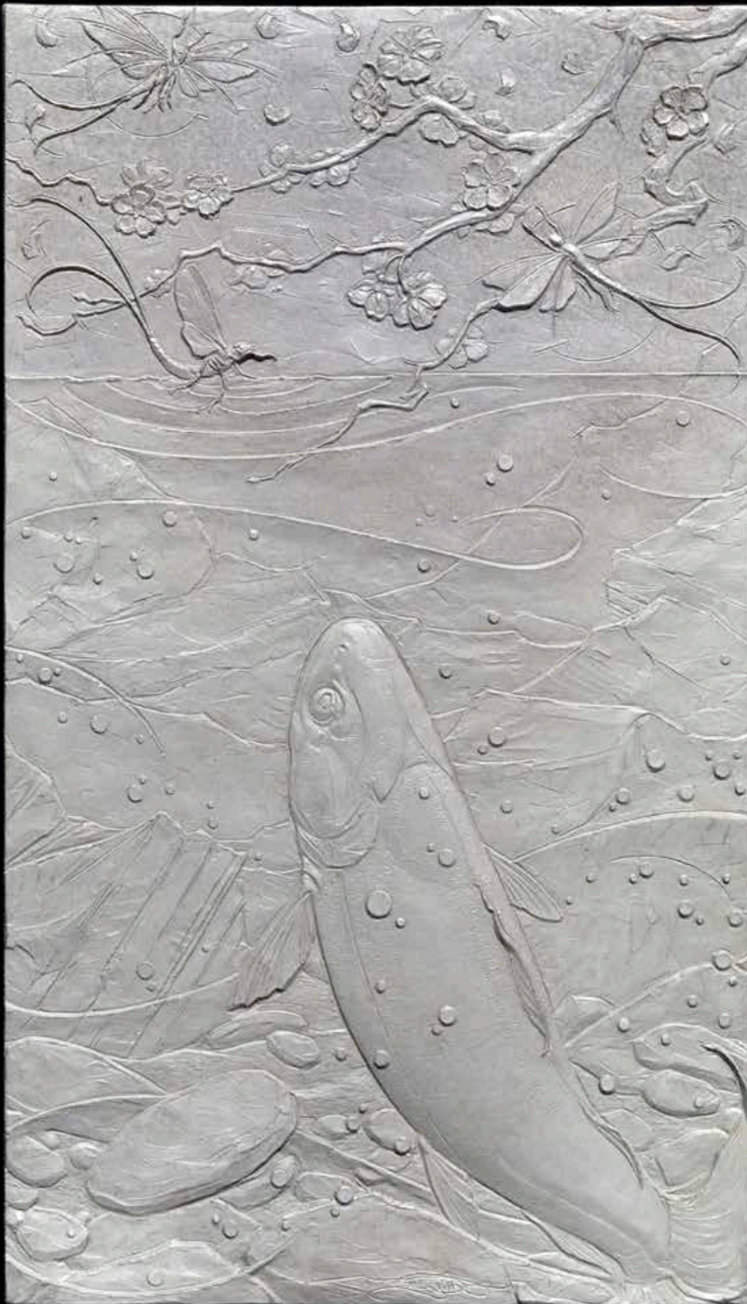
3 Jeremiah Welsh, May Flies and Trout Rise , cast bronze, 11¾ x 20½"