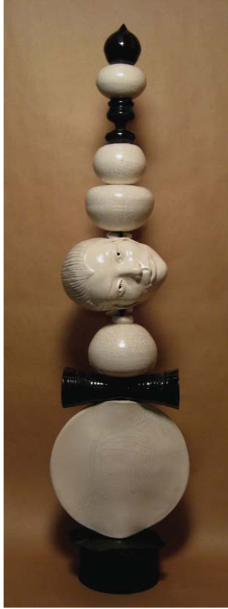
Assembled Thoughts by Pamela Mummy, NSS

The membership numbers for National Sculpture Society as of December 31, 2018 were as follows: