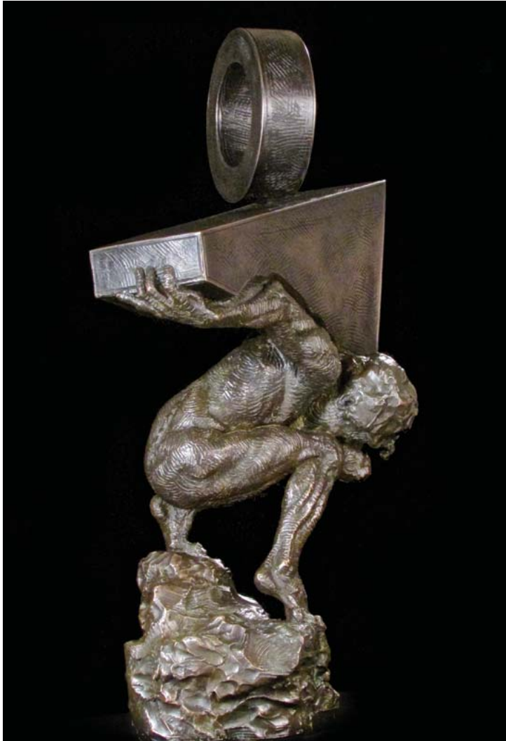
Contemporary Struggle by Wesley Wofford, FNSS

The Executive Committee recommends the election of the following 2019 slate: