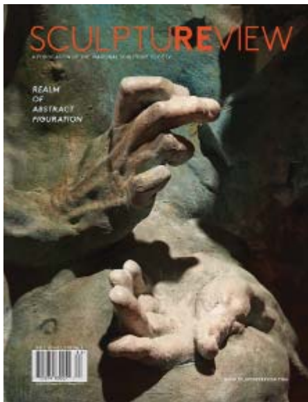
Fall 2018: Realm of Abstract Figuration