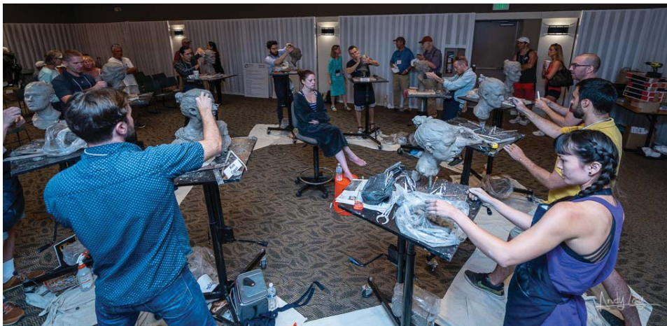
Scene of the 2018 Richard McDermott Miller Modeling Competition