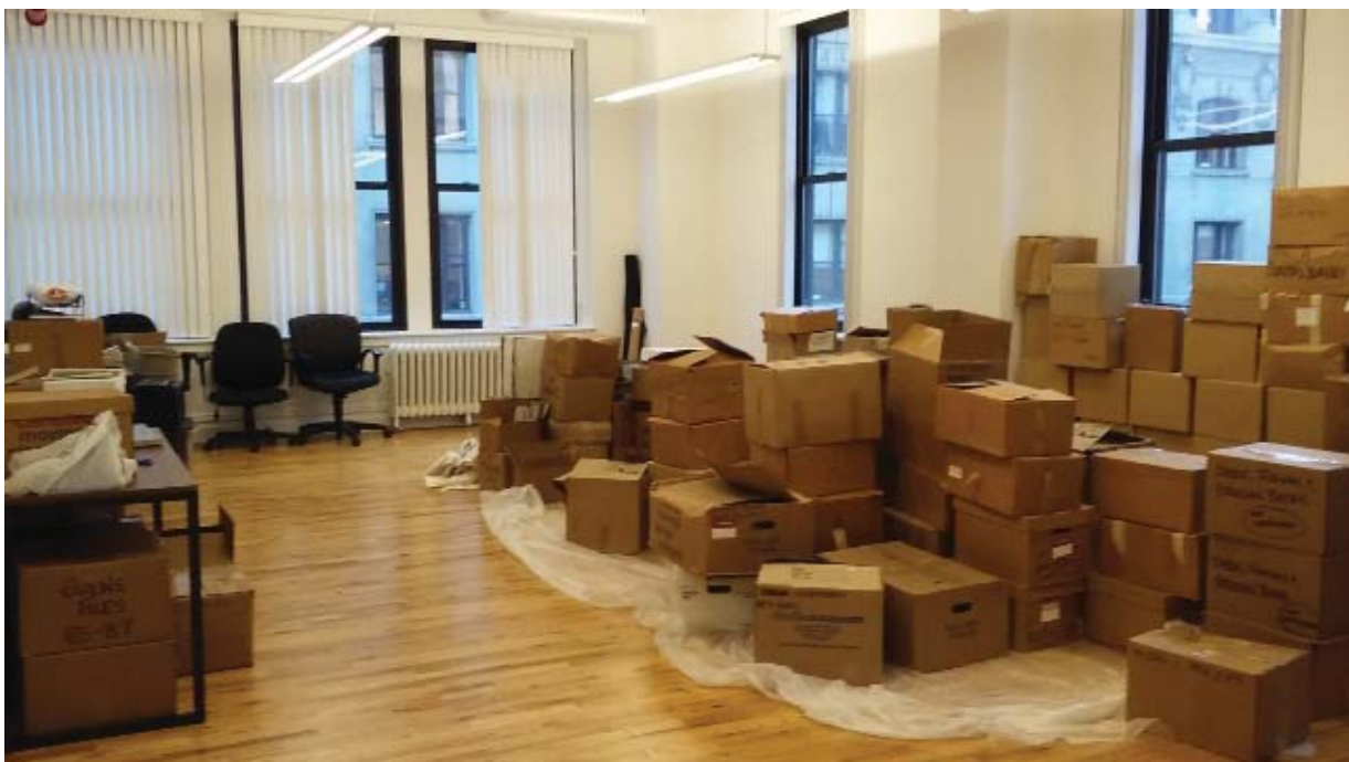
New NSS office at 6 E 39th St Ste 903, New York, NY 10016