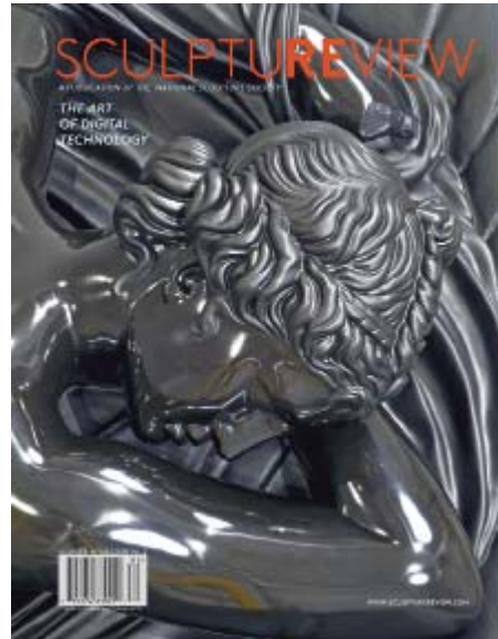
Summer 2018: The Art of Digital Technology