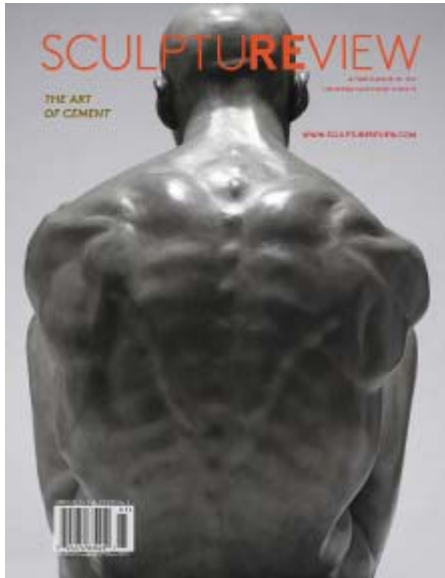
Spring 2018: The Art of Cement

The Editorial Board oversaw the production of four issues of Sculpture Review in 2018: