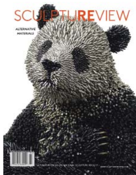
Winter 2018: Alternative Materials