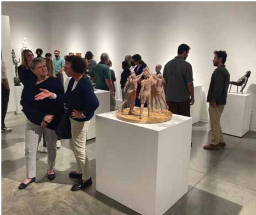
Reception for the Figurative Sculpture Invitational at the Herron School of Art and Design