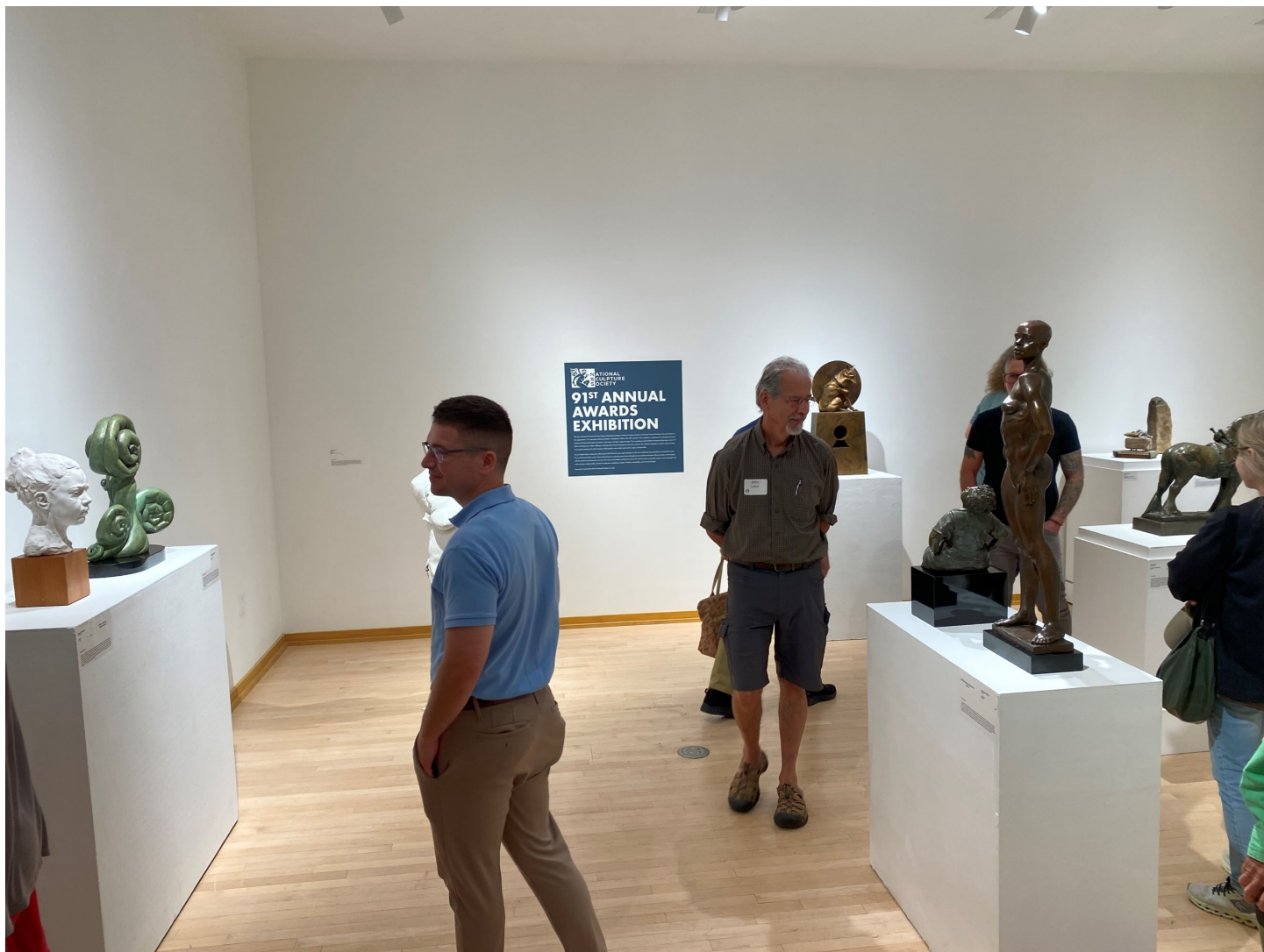
91 st Annual Awards Exhibition installed at Indy Art Center

We are optimistic that friends of the organization will continue to participate in growing numbers and support the National Sculpture Society in its mission to promote representational sculpture. With the help of all our membership, board members, and our staff, we're looking forward to a very exciting and productive 2025 and beyond.