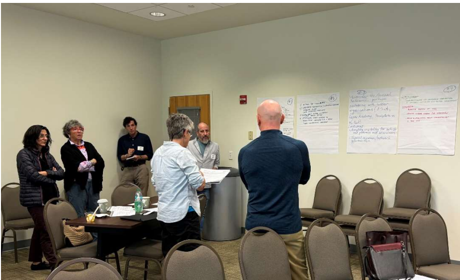
Scene from the Visioning Retreat