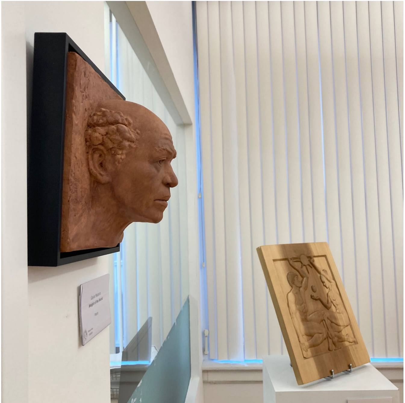
Scene of PRIMARY VIEW: Sculpture in Relief

Please check the NSS website for all your exhibition news and updates.