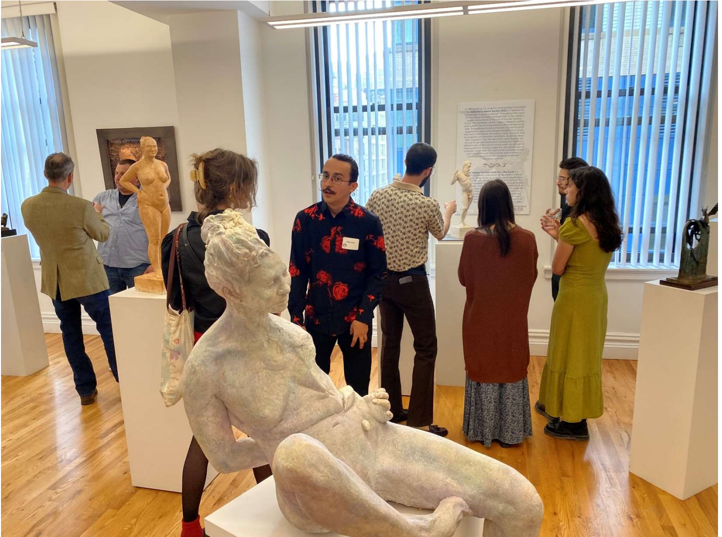
Reception for the 2024 Young Sculptors Exhibition

May I now have a motion to adjourn the meeting? Second the motion? All in favor, please raise your hands. Thank you.