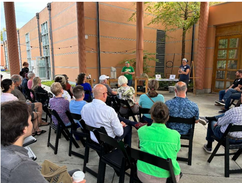
Indiana Limestone Symposium

The next Sculpture Celebration will be this June 6-7 in New York City.